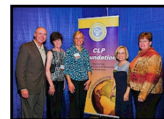
48 th Annual NEFA Convention

We are pleased to announce that the CLP Foundation just returned from exhibiting at the ELFA 48 th Annual Convention in San Diego, October 18 th , 19 th and 20 th . However, you may have visited the CLP Booth in September at NEFA's Annual Funding Symposium in Monterey. Or, perhaps you attended the Introduction to CLP Class at the NAELB Fall Conference in Atlanta. CLP is certifying leasing professionals across the nation and around the globe.